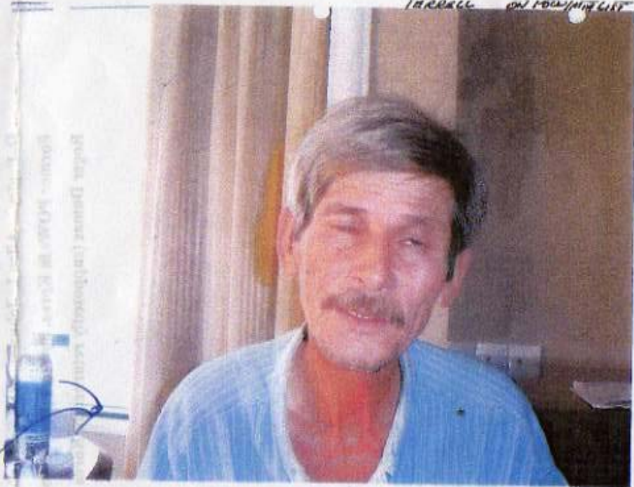
TERRELL ON POW/MIA LIST