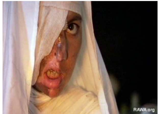
A young Afghan woman who tried and failed to burn herself to death.

The ten-year bombing exercise killed an estimated 1 million Laotians. Despite questions surrounding the