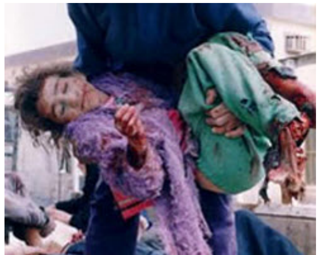
One of the first victims in the current Iraq war, hit by U.S. bombs on March 19, 2003 in the city of Basra.

Do you want to spend your life paying for the death of people (executed by the U.S. military) that you would probably have loved if you have met them? Do you want to spend your life paying for the arsenal of hydrogen bombs that could very well destroy most of the life on the planet? If not, if you want another kind of life, then as author James Howard Kunstler often suggests, “You will have to make other arrangements.” You will have to arrange to live according to your own deepest