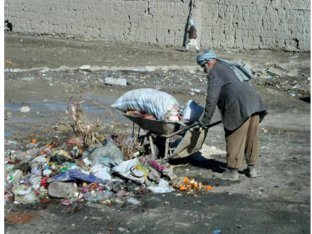
Kabul today, after 10 years of occupation and $300 billion spent.

year war” there, and who are themselves mostly jobless in a society in which there is almost no economy and no work.