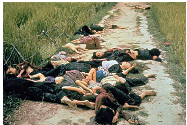
Bodies from the My Lai massacre, where 450 villagers were shot at close range. Most villages were simply destroyed from the air.

In Cambodia, the United States was concerned that the North Vietnamese might have established a military base in the country. In response, The U.S. dropped three million tons of ordnance in 230,000 sorties on 113,000 sites between 1964 and 1975. 10% of this bombing was indiscriminate, with 3,580 of the sites listed as having