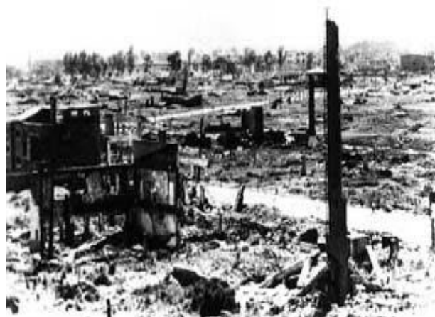
Pyongyang, the capitol of North Korea, after being destroyed by the U.S. Every city and village in North Korea was bombed to rubble.

In Iraq, Saddam Hussein came to power through a U.S.-CIA engineered coup in 1966 that overthrew the existing socialist government and installed Saddam’s Baath Party. Later conflict with Saddam led to the first and second Gulf Wars, and to thirteen years of severe U.S.-imposed economic sanctions on Iraq between the two wars, which taken together completely obliterated the Iraqi economy. An estimated one million people were killed in the two Gulf wars, and the United Nations estimates that the economic sanctions, in combination